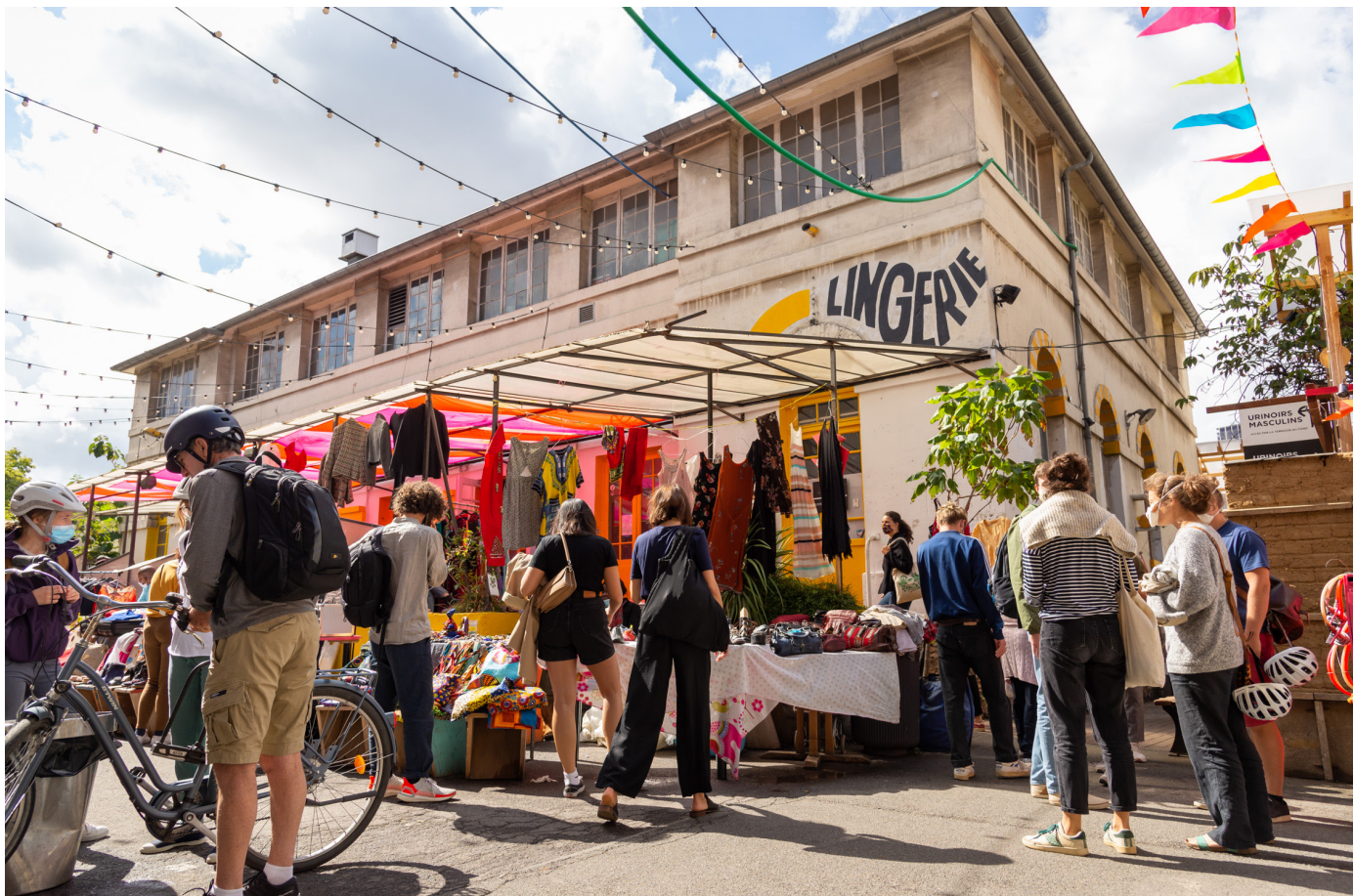
La Lingerie on the market day.