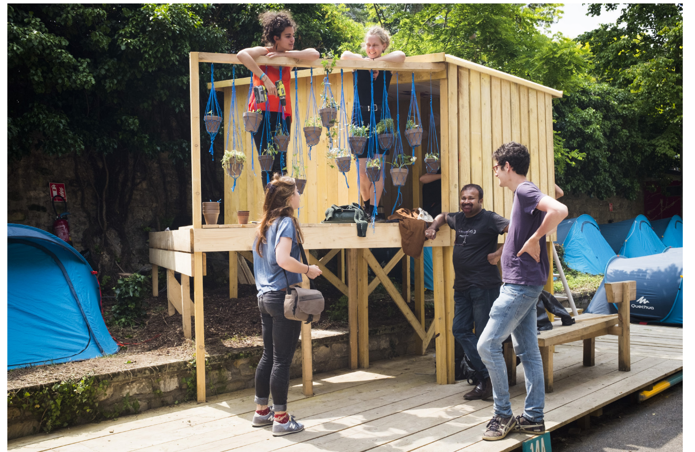
The Traucco hut at the campsite, 2017.