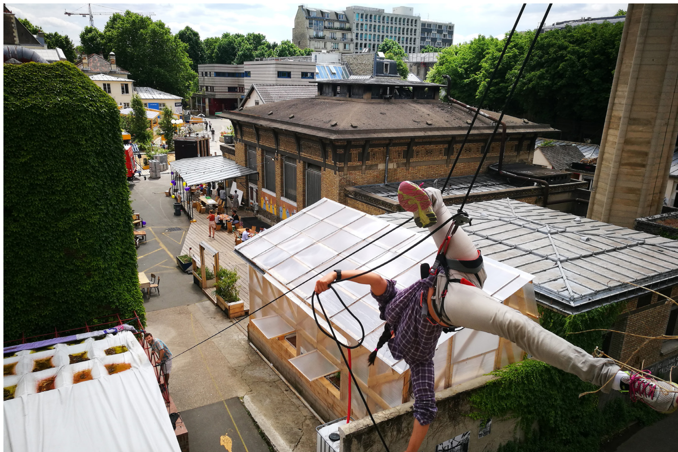
Vertical Dance on the Lelong building.