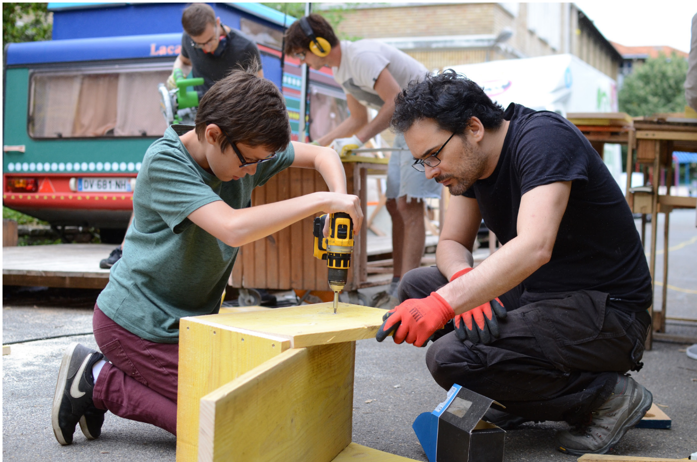
Construction of furniture during the public workshops of the Vendredi Chantier.