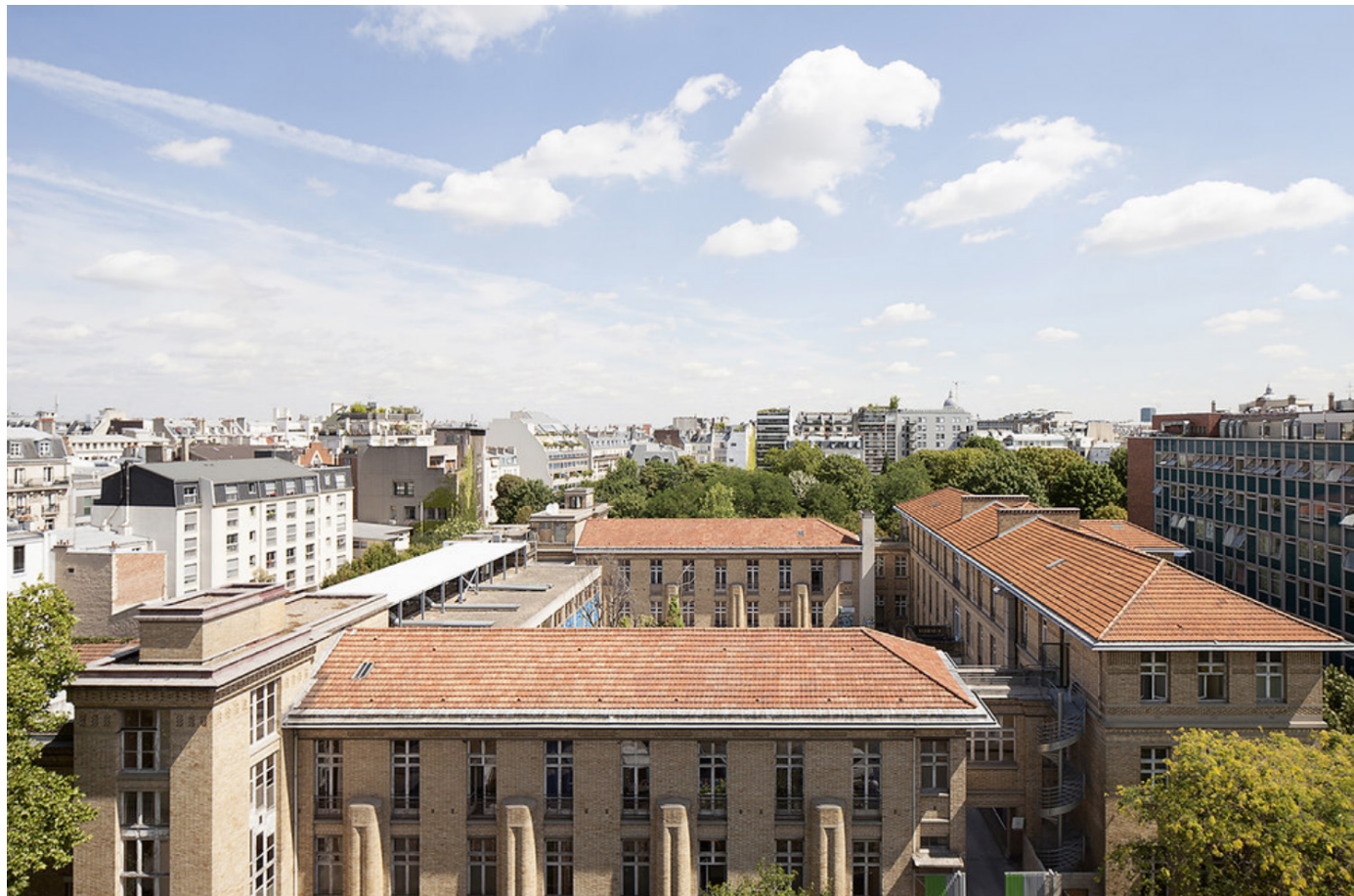
The Pinard building, which hosted the associations Aurora and Coallia during the Season 1.