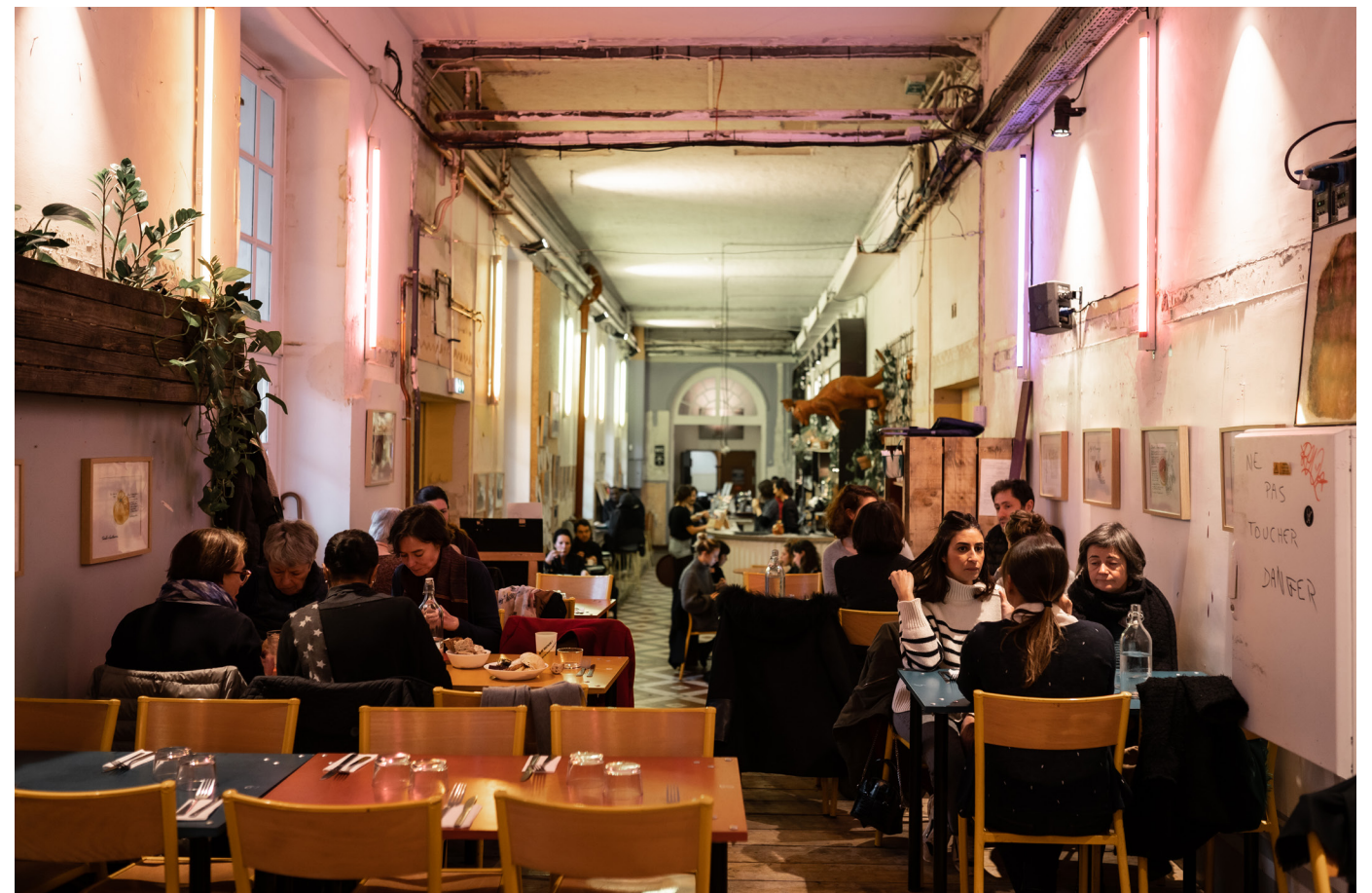
Hall of the Oratory's communal restaurant, where chefs and new cooks from integration programme meet.